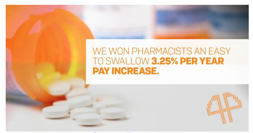
Share on Facebook