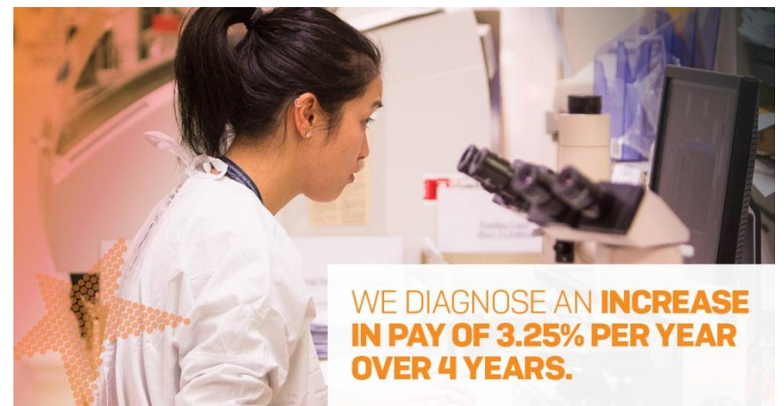
Share on Facebook