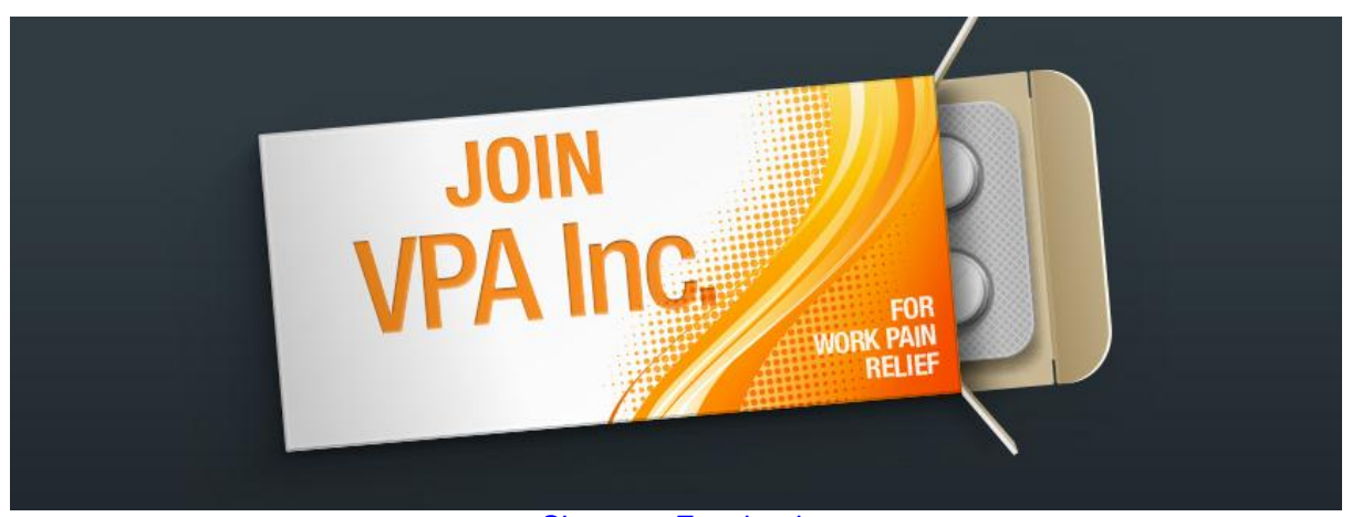
Share on Facebook